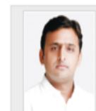
श्री अखिलेश यादव मा० मुख्यमंत्री उ०प्र०